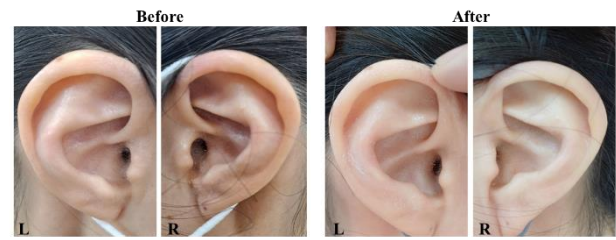
Fig. 2. Ear morphology changes in the patient after OCNT. The overall skin tone of the patient's ear dermatome corresponding to the uterus and stomach was brightened after OCNT. Whereas there was indentation of the lower portion of the ear which represents the inner ear prior to OCNT, this area became relatively flat post-OCNT.

In some respects, this method of diagnosis may seem rather odd. It appears ironic that the ears, which are part of the body and have a relatively small surface area, represent various body parts. First of all, the concept of dermatomes must be understood. Dermatomes are areas of skin on the body that rely on specific nerve connections to the spine. All skin sensations are transmitted by peripheral nerves that are spread over the extremities. The peripheral nerve root extends from the dorsal horn of the spinal cord, and in cases where the site of paresthesia coincides with a given dermatome, the problem experienced by the patient is likely to be associated with the peripheral nerves serving the dermatome. 31,32 From this perspective, the deep indentation in the ear dermatome of the patient, which includes the inner ear, suggest that the patient is suffering from problems with the corresponding organ. Also, the clear difference observed pre- and post-OCNT in the ear dermatome which represents the uterus and stomach indicates that the reflex points and auxiliary blood vessels of the organs are closely associated (Fig. 2). As the VAS (Visual Analog Scale) Score, which represents only the subjective opinion of the patient, was improved to 1 or 0, this relationship cannot be precluded.