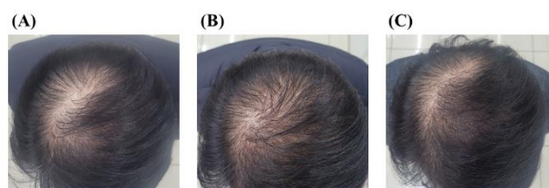
Fig. 2. Hair status at the vertex before and after nutrition therapy implementation: (A) before treatment, (B) one month after, and (C) two months after

Following the prescribed nutrition therapy for hair loss, gradual hair regrowth was observed at the vertex region over monthly evaluations (Fig. 2). Moreover, one month after starting the OCNT, the patient reduced his dosage of Dutasteride from once a day to once weekly.