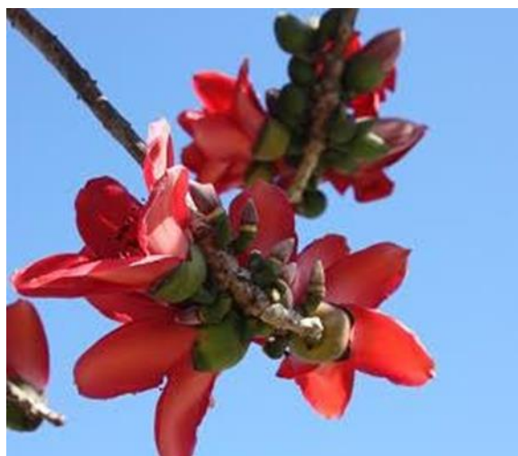
Fig. 1. Flower of Mochrus ( Bombax ceiba Linn).

Khan et al. (2011) isolated and characterise a new flavone from the flower extract of Bombax ceiba using mass, NMR, IR