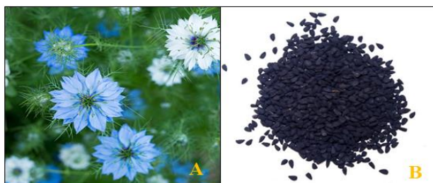
Fig. A & B. Flowers and Seeds of Nigella sativa

Transverse section of seed demonstrate single layer of epidermis comprising of elliptical, thick-walled cells covered externally by papillose cuticle. 2-3 layers of parenchymatous cells, a reddish-brown pigmented layer composed of tangentially elongated cells, followed by rectangular, radially elongated cells. Endosperm consists of moderately thick-walled polygonal cells, numerous oil filled globules and embryo entrenched in it (Paarakh, 2010; Ahmad et al. , 2013; Anonymous, YNM).