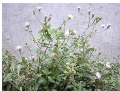
Fig.3 Mature plant of V. cinerea