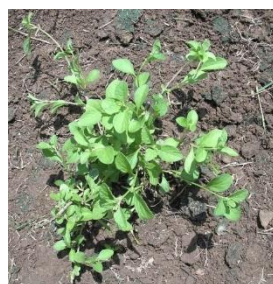
Fig.1 Market sample of V.cinerea Fig.2 Young plant of V. cinerea