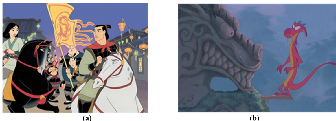
Figure 3. (a) dragon-shaped patterns on flag; (b) Mushu

The explanation of dragon in the Webster's English Dictionary: an imaginary monster that was supposed to be a huge winged reptile, often spouting fire. Compared to the image of the solemn and sacred dragon in China, Mushu is more American-style funny, which is a choice made by Disney in the cultural integration.