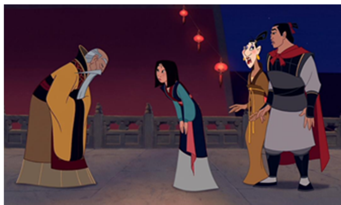
Figure 4. The emperor bowed to Mulan

it shows the greatest respect for women-equality between men and women. It's not because Mulan is a woman and her rank is lower than Li Xiang's that all the honor are counted on Li Xiang.