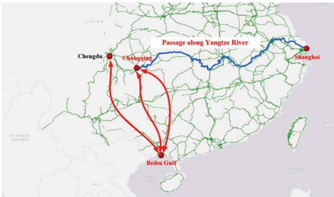
Figure 1: New Western Land-Sea Corridor Route Map

extension zone (NDRC, 2019). Among them, the three main corridors are Chongqing via Guizhou and Guangxi to the Beibu Gulf outlet (Guangxi); Chongqing via Huaihua (Hunan) and Liuzhou (Guangxi) to the Beibu Gulf outlet; and Chengdu via Luzhou (Sichuan) and Baise (Guangxi) to the Beibu Gulf outlet. The core coverage area includes Chongqing, Guangxi, Guizhou, and Gansu provinces and municipalities. The radiation extension zone includes Yunnan, Hainan, Sichuan, Ningxia, Shaanxi, Inner Mongolia, Tibet, Qinghai, and Xinjiang, achieving full coverage of western China. See Figure 1 for a schematic diagram of the corridor route.