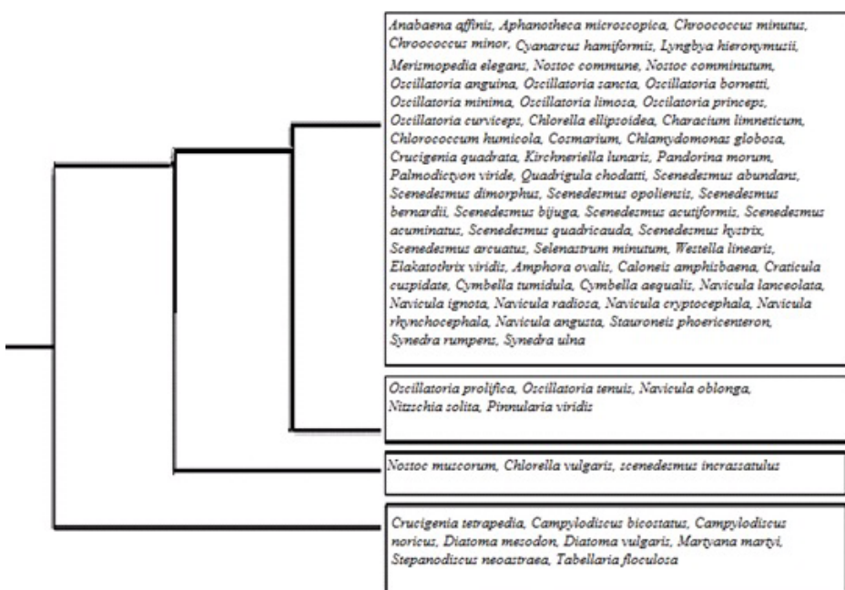
Fig. 2 Dendrogram of the 4 groups or communities (I–IV) derived after the application of two-way indicator species analysis (TWINSPAN) classification technique.

Water properties are considered the key driving factors for abundant microalgae in lakes and water canals. Temperature and salinity are the main factors in controlling species distribution and abundance (Zakaria and El-Naggar 2019). Tavsanoğlu et al. (2015) showed that the changes in salinity will have a substantial impact on aquatic ecosystems, where it can result in osmotic stress on cells, uptake or loss of ions, and effects on the cellular ionic ratio. Dissolved oxygen is considered one of the maximum important factors controlling the biota in the aquatic habitat. Relatively high oxygen was observed during summer and autumn in Naubaria site which could be an indication of high phytoplankton counts. Increased human activity and discharged sewage containing high levels of nutritional salts as well as other toxic compounds had a significant impact on the biotic factors of several sites along the Mediterranean Sea coast (Farrag et al. 2019; Shaban et al. 2020). The obtained results confirm that the water properties and