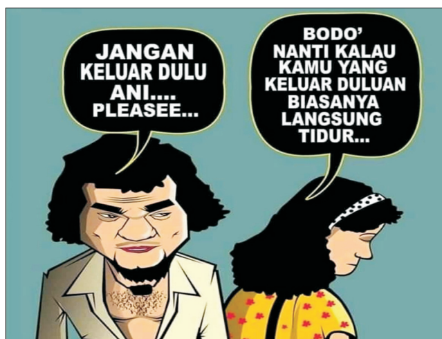
Fig. 6. Meme of dangdut singer cartoons and his partner.