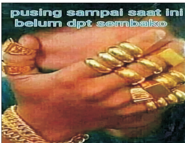
Fig. 8. Meme critique of rich people who hope for COVID-19 social assistance.

This meme was intensely discussed in two WA groups (Pojok NTB and S2 Komunikasi 2002) when the Social Affairs Minister, Juliari Batubara, reported corruption in social assistance funds. News about this had gone viral in mainstream media and online media in early December 2020. The meme in Fig. 9 has a connotative meaning in the form of satire and criticism of the Minister of Social Affairs, who since that December 6 has been designated by the Corruption Eradication Commission as a corruption suspect of COVID-19 social assistance. The corruption carried out by the Minister of Social Affairs towards the COVID-19 social assistance funds made the public’s perception of corruption committed by government officials increasingly confirmed. The Global Corruption Barometer survey compiled by Transparency International in 2017 shows that 50 percent of the public considers government officials to be involved in corruption (Lokadata, 2017).