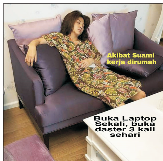
Fig. 4. Craving housewife meme.

From all types of memes related to the lockdown, three memes have been discussed for a relatively long time by the WA group. The three memes all contain pornographic elements that are packed with funny language. In Fig. 4, for example, a meme is shared with a picture of a housewife leaning on the sofa in a drunken state because she has a craving for lingerie. This meme image is equipped with a pornographic sentence, namely “Due to husband working at home” then followed by the sentence “Open laptop once, open negligee 3 times a day.” The sentence is also the denotative meaning of the meme.