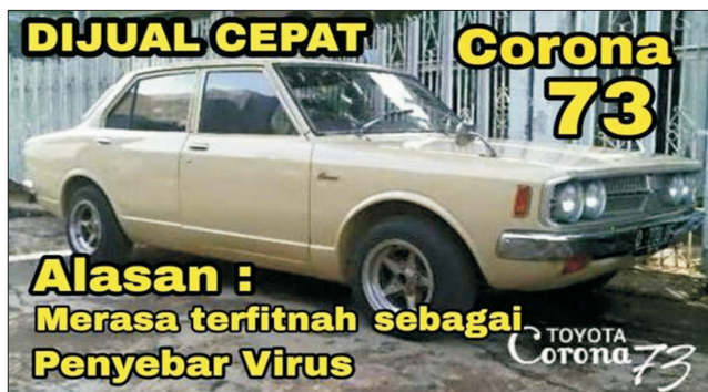
Fig. 3. Coronavirus meme using car brands.

When President Joko Widodo announced the exis-