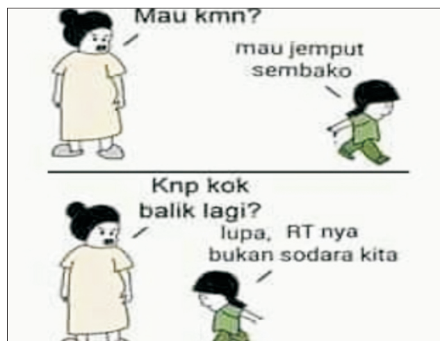
Fig. 7. Meme critique of social assistance discrimination.

When the COVID-19 pandemic did not show any sign of ending after being endemic for approximately four months in Indonesia, many people became economically affected. The governments in central, provincial, and district levels began to distribute social assistance to the community. Mainstream mass media and online media also shared the agenda for distributing social assistance