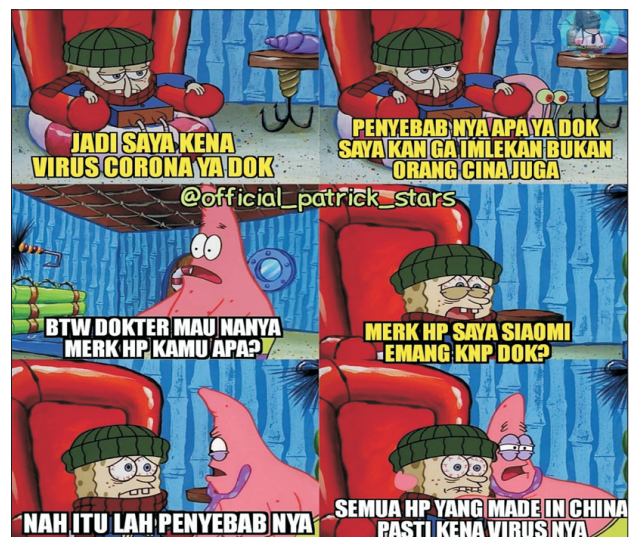
Fig. 2. Coronavirus meme using SpongeBob cartoon character.