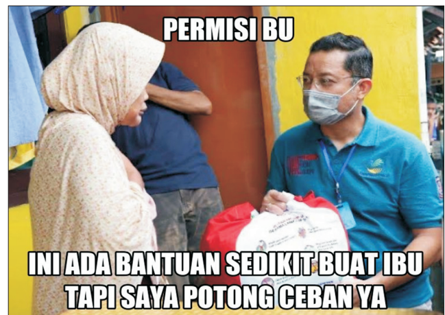
Fig. 9. Meme of satire and criticism of the Minister of Social Affairs.