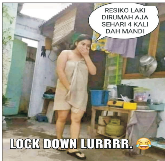
Fig. 5. Meme of young mother who just came out of the bathroom.