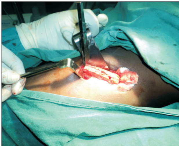
Fig. 2. The iliac crest exposed and vertical stops placed bilaterally at the required length.

Kelvin Omeje et al: A two-year audit of non-vascularized iliac crest bone graft for mandibular reconstruction: technique, experience and challenges. J Korean Assoc Oral Maxillofac Surg 2014