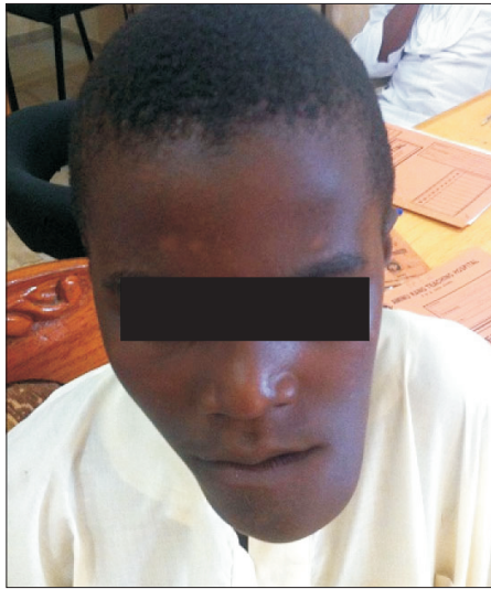
Fig. 1. Preoperative photograph of a 17-year-old boy with mandibular ameloblastoma.