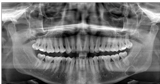
Fig. 1. Panoramic view shows the lesion. Elluru Venkatesh: Stafne bone cavity and cone-beam computed tomography: a report of two cases. J Korean Assoc Oral Maxillofac Surg 2015

A radiographic diagnosis of SBC was considered and the patient was advised to undergo regular follow-up examinations.