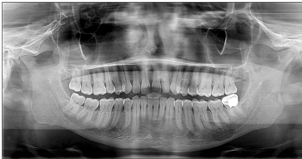
Fig. 3. Panoramic view shows the lesion. Elluru Venkatesh: Stafne bone cavity and cone-beam computed tomography: a report of two cases. J Korean Assoc Oral Maxillofac Surg 2015

CBCT facilitates both diagnosis and follow-up, especially through the reconstructed images that show radiographic features in fine detail. In both of our cases CBCT was very