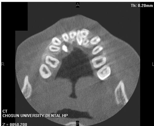
Fig. 2. An impacted conical-shaped mesiodens. Sung-Suk Lee et al: A comparative analysis of patients with mesiodens: a clinical and radiological study. J Korean Assoc Oral Maxillofac Surg 2015

their visit to the hospital for another treatment.(Table 1)