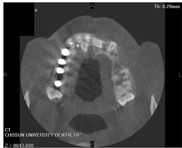
Fig. 3. Two horizontally impacted mesiodens. Sung-Suk Lee et al: A comparative analysis of patients with mesiodens: a clinical and radiological study. J Korean Assoc Oral Maxillofac Surg 2015

On the basis of clinical examinations, 200 patients (52.9%) had no specific symptoms due to the presence of mesiodens, 94 patients (24.9%) had diastema, 59 patients (15.6%) had delayed eruption of a permanent incisor, and 22 patients (5.8%) had an angled incisor due to the mesiodens. Inflammation caused by the mesiodens was observed in three (0.8%)