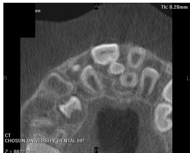
Fig. 4. A mesiodens impacted on the palatal side of the central incisor. Sung-Suk Lee et al: A comparative analysis of patients with mesiodens: a clinical and radiological study. J Korean Assoc Oral Maxillofac Surg 2015