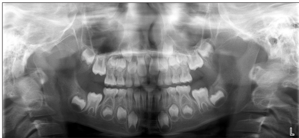
Fig. 1. A mesiodens found in an oral panoramic X-ray. Sung-Suk Lee et al: A comparative analysis of patients with mesiodens: a clinical and radiological study. J Korean Assoc Oral Maxillofac Surg 2015

Patients were analyzed for motivation to visit to the hospital. Of the 378 enrolled patients, 323 patients (85.4%) were referred from other hospitals specifically for removal of the supernumerary tooth. In 15 patients (4.0%) cases, an orthodontic problem was caused by the mesiodens; in 40 patients (10.6%) cases, the mesiodens was found by chance during