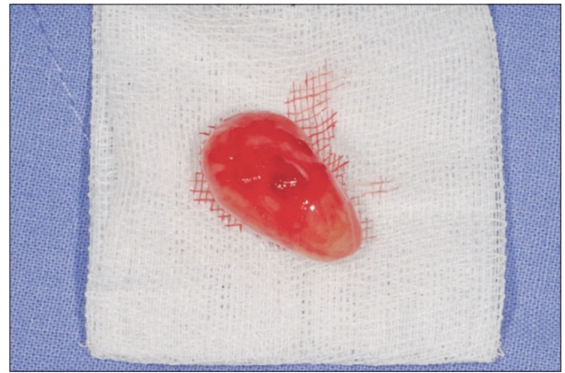
Fig. 3. A 2.3x1.3x1.3 cm ovoid mass was found. Eun Jo et al: Deep benign fibrous histiocytoma in the oral cavity: a case report. J Korean Assoc Oral Maxillofac Surg 2015