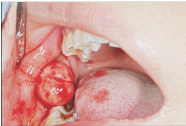
Fig. 2. Incision and dissection was easily done. The mass was well-encapsulated. Eun Jo et al: Deep benign fibrous histiocytoma in the oral cavity: a case report. J Korean Assoc Oral Maxillofac Surg 2015