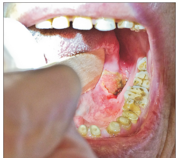
Fig. 2. Second evaluation of the lesion. Fabrizio Corliano et al: Iron supplement tablet embedded in the oral cavity mimicking neoplasm: a case report. J Korean Assoc Oral Maxillofac Surg 2016