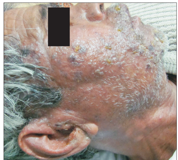
Fig. 1. Herpetic lesions involving the maxillary and mandibular divisions.

The patient was conscious, delirious, irritable, and appeared tired and distressed. He was moderately built and poorly nourished. There was history of a loss of appetite and weakness for the past six months. On examination, multiple cutaneous vesicles and scabs covered the same side of his cheek, ear, upper and lower lips, chin, and submandibular region.(Fig. 1) Mild diffuse swelling on the right half of the lips was noted, and generalized ulceration of the right buccal and labial mucosa was present.(Fig. 2, 3) Ulcerations on the anterior two-thirds of the right half of the tongue, lingual mucosa, tonsillar pillars, and the soft palate were also present. The ulcers were irregular and more than a centimeter in size and were covered with slough. The patient also complained