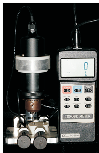
Fig. 2. Detorque reading using a torque meter. Antonio Gabriel Lanata-Flores et al: Stability of the prosthetic screws of three types of craniofacial prostheses retention systems. J Korean Assoc Oral Maxillofac Surg 2016

Data analysis was performed using the computer programs Biostat 5.0 (Belém, Brazil) and PASW Statistics 18.0 (IBM Co., Armonk, NY, USA). The detorque values were submitted to the Shapiro-Wilk and Levene method; despite having