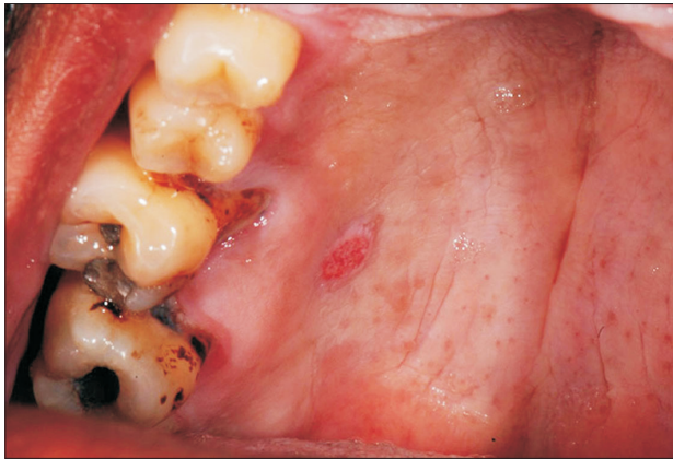
Fig. 1. Clinical appearance of the lesion on the hard palate showing verrucous surface and erythematous spots, measuring approximately 5 mm in diameter.

Alexandre Simões Garcia et al: Verruciform xanthoma in the hard palate: a case report and literature review. J Korean Assoc Oral Maxillofac Surg 2016