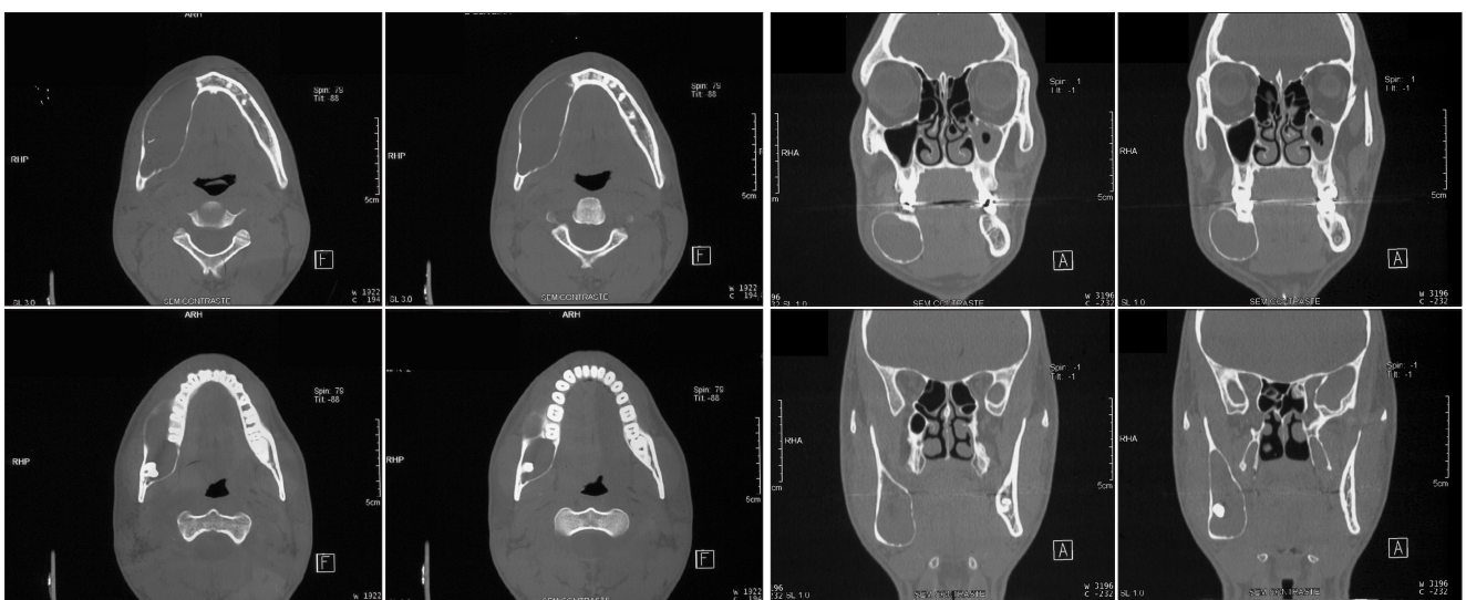
Fig. 3. Axial and coronal computed tomography scans highlighting lesion expansion. Note the lingual and buccal cortical plate expansion and thinning.

Sérgio Lúcio Pereira de Castro Lopes et al: Aggressive unicystic ameloblastoma affecting the posterior mandible: late diagnosis during orthodontic treatment. J Korean Assoc Oral Maxillofac Surg 2017