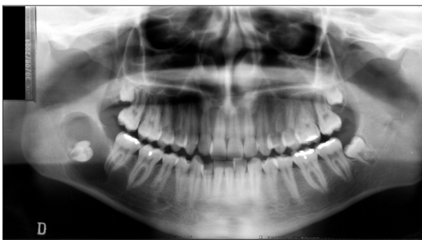
Fig. 1. First panoramic radiograph acquired for orthodontic planning showed a unilocular radiolucent image associated with the mandibular right third molar.

An incisional biopsy was performed and histopathological