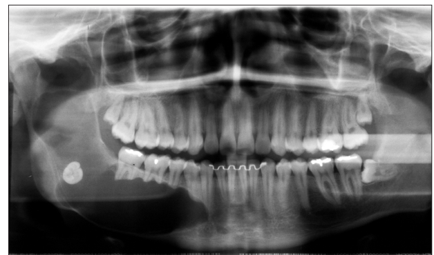
Fig. 2. Panoramic radiograph after the orthodontic treatment showing a well-defined extensive unilocular lesion with the involvement of the mandibular third molar.

Sérgio Lúcio Pereira de Castro Lopes et al: Aggressive unicystic ameloblastoma affecting the posterior mandible: late diagnosis during orthodontic treatment. J Korean Assoc Oral Maxillofac Surg 2017