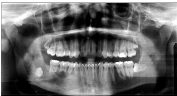
Fig. 4. Panoramic radiograph showing the decompressed lesion area with a radiopaque filling, suggesting bone neoformation. Sérgio Lúcio Pereira de Castro Lopes et al: Aggressive unicystic ameloblastoma affecting the posterior mandible: late diagnosis during orthodontic treatment. J Korean Assoc Oral Maxillofac Surg 2017

Ameloblastomas have a well-documented tendency to