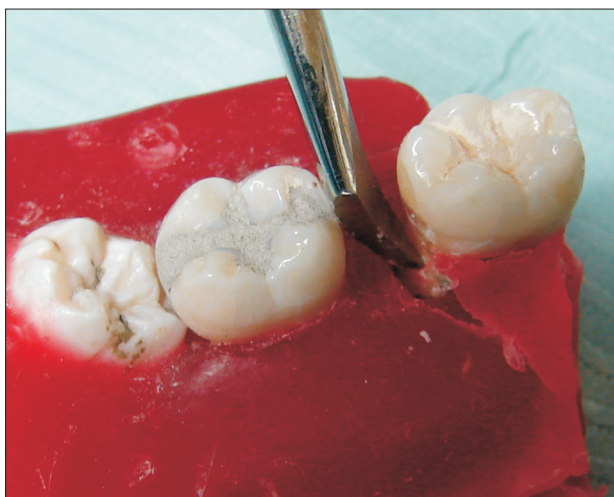
Fig. 2. A model shows a Cryer elevator placed inside a socket such that the dorsal aspect of the tip contacts the neighboring tooth or socket wall, and the tip contacts an exposed flat surface on the tooth. John Mamoun: Use of elevator instruments when luxating and extracting teeth in dentistry: clinical techniques. J Korean Assoc Oral Maxillofac Surg 2017