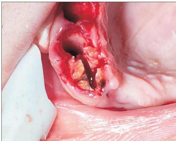
Fig. 7. A 4-way split of the coronal aspect of a maxillary central incisor with an ellipsoid cross section that is bounded by thin buccal bone that could fracture under luxation forces.

John Mamoun: Use of elevator instruments when luxating and extracting teeth in dentistry: clinical techniques. J Korean Assoc Oral Maxillofac Surg 2017