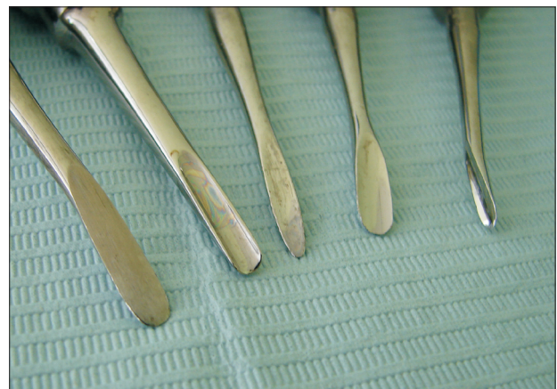
Fig. 6. Examples of straight elevator tip shapes (left to right): a flat tip without longitudinal side curvature, a tip with slightly too much curvature per unit length, a tip whose center protrudes compared to points lateral to the center, a large elevator with less curvature per unit of tip length and where the tip center is minimally protrusive, and a small elevator with a dorsal curvature of the entire working end.

John Mamoun: Use of elevator instruments when luxating and extracting teeth in dentistry: clinical techniques. J Korean Assoc Oral Maxillofac Surg 2017