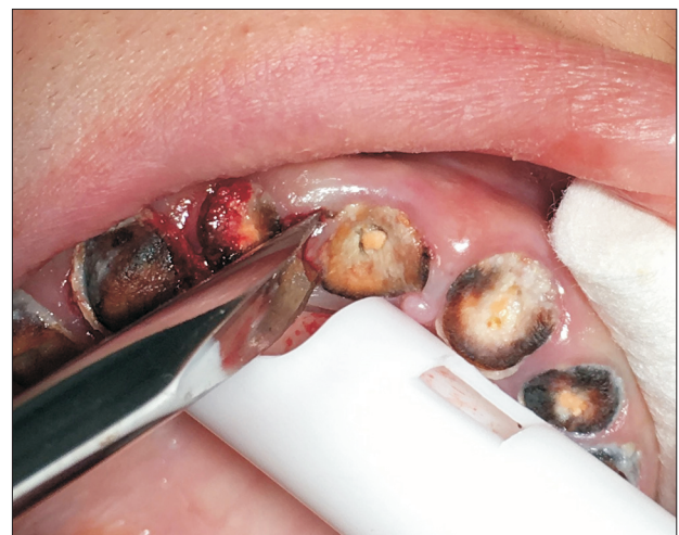
Fig. 1. A straight elevator is used to luxate a carious root tip, with the elevator tip positioned at the root tip superior perimeter. John Mamoun: Use of elevator instruments when luxating and extracting teeth in dentistry: clinical techniques. J Korean Assoc Oral Maxillofac Surg 2017

Since the Cryer elevator generally only contacts a tooth at a single point, it is not capable of the basic oscillating motion described previously, since this oscillating motion requires