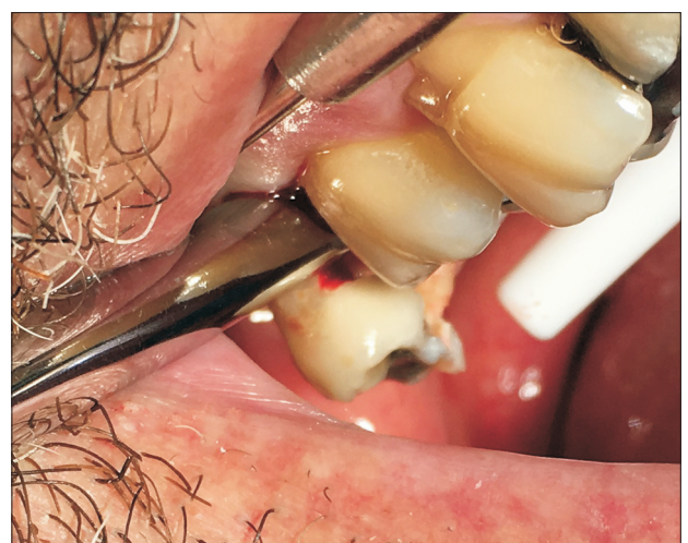
Fig. 4. A straight elevator luxates a maxillary third molar with a rotational force, with the elevator shaft positioned approximately perpendicular to the tooth long axis. John Mamoun: Use of elevator instruments when luxating and extracting teeth in dentistry: clinical techniques. J Korean Assoc Oral Maxillofac Surg 2017