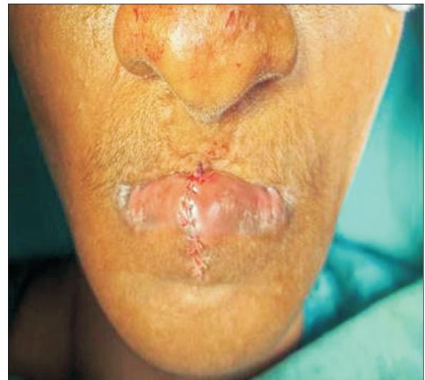
Fig. 4. Intraoperative photograph demonstrating the closure of the surgical wound following vertical wedge excision of the lower lip pit. Sunil Richardson et al: Van der Woude syndrome presenting as a single median lower lip pit with associated dental, orofacial and limb deformities: a rare case report. J Korean Assoc Oral Maxillofac Surg 2017

Lip pits are the most consistent feature of the syndrome and in some cases can be the only manifestation of the syndrome. Approximately 90% of VWS patients display lower lip pits, and in about 64% of cases, lip pits are the only visible defects 3 . The most accepted theory of lip pit development in VWS involves notching of the lip at the early stage of labial development with fixation of the tissue at the base of the notch 5 . The other most accepted theory is the persistence of embryonic lateral sulci in the lip following failed fusion, ultimately giving rise to the typical pits seen in VWS 8 . The surface opening is usually circular, but transverse slits have also been reported. They usually communicate with the underlying minor salivary glands by forming canals that penetrate the orbicularis oris muscle at a variable distance of