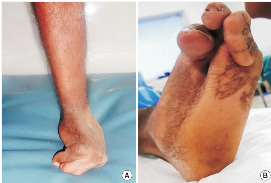
Fig. 2. Photograph of the left foot. A. Photograph demonstrating clubbing of the left foot. B. Photograph showing syndactyly of the second to fifth lesser toes of the left foot. Sunil Richardson et al: Van der Woude syndrome presenting as a single median lower lip pit with associated dental, orofacial and limb deformities: a rare case report. J Korean Assoc Oral Maxillofac Surg 2017

profile, suggestive of a hypoplastic maxilla, with microstomia and bilateral scars from the previous lip surgery.(Fig. 1. B) The lower lip deformity was a single, circular, and invaginated midline lesion on the vermilion border, roughly 1.0×1.0 cm in size that was soft and non-tender.(Fig. 1. C) The size of the lesion remained unchanged throughout the patient's life. The lesion also contained a transverse, slit-like opening that, on gentle manipulation of the lower lip, secreted thick mucus. Using a lacrimal probe, the pit was found to have a depth of 17 mm. The patient was examined for associated anomalies, which revealed clubbing of the left foot with syndactyly of the second to fifth lesser toes.(Fig. 2) On intraoral examination, a scar on the soft palate from previous cleft palate repair was present.(Fig. 3. A) Along the maxillary arch, the right central incisor and right and left lateral incisors were found to be missing. On the mandibular arch, the left deciduous second molar was found to be over-retained.(Fig. 3. A, 3. B)