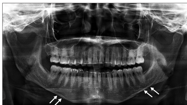
Fig. 1. Panoramic view of Case 1 showing inferior alveolar nerve cutting (white arrows).

A 31-year-old Korean female visited complaining of an abnormal facial sensation due to previous mandibular angle