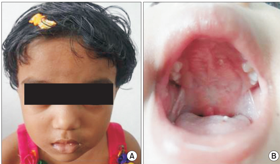
Fig. 3. Postoperative photographs of the patient at 3 years follow-up. A. Extraoral view. B. Intraoral view.

Sunil Richardson et al: Modified two flap palatoplasty in asymptomatic transsphenoidal encephalocele: a case report. J Korean Assoc Oral Maxillofac Surg 2018