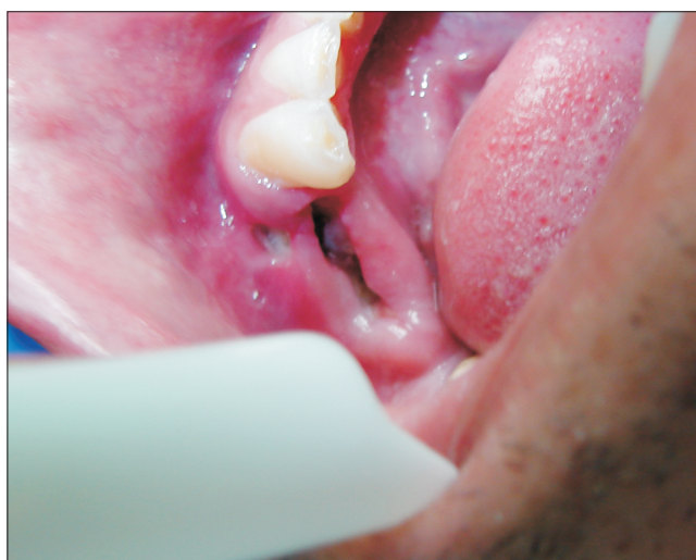
Fig. 3. A dry socket lesion with separate buccal and occlusal areas of exposed bone.

A healing dry socket is a previous dry socket that is now completely covered with vital epithelium such that this epi-