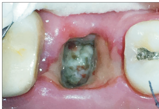
Fig. 4. Example of a previous dry socket lesion that is now fully covered with a layer of epithelium that does not wash away with irrigation.

Comprehensive reviews of the proposed causes of dry