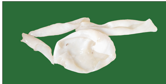
Fig. 4. In-toto enucleated cyst.

Untreated conditions will lead to the development of complications, which include anaphylaxis by spontaneous rupture of the cyst, pyogenic abscess in secondarily infected cysts, compression symptoms, and internal organ damage. A pyogenic abscess in the infected cyst was the cause for the chief complaint in the current patient. The antibiotic regimen helped to reduce the infection, but the causative lesion per-