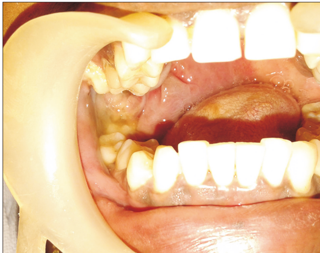
Fig. 1. Intraoral view of the lesion. Siji J. Chiramel et al: Primary hydatid cyst of the pterygomandibular region: an unusual cyst, location and case report. J Korean Assoc Oral Maxillofac Surg 2020