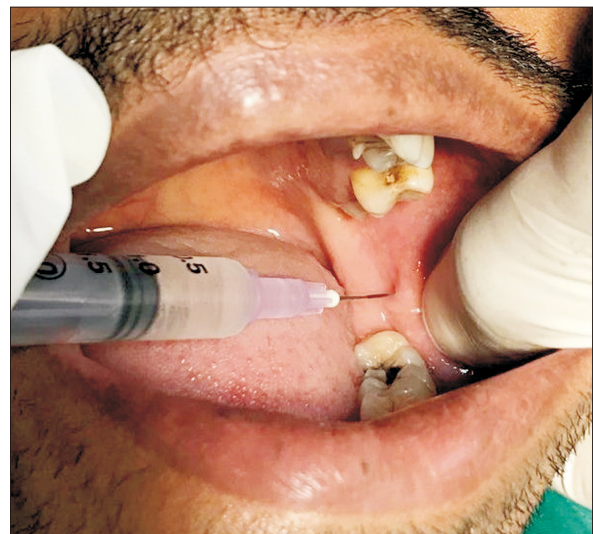
Fig. 4. Contralateral placement of the syringe for administration of inferior alveolar nerve block after crossing the internal oblique ridge. Benny Joseph et al: Single-insertion technique for anesthetizing the inferior alveolar nerve, lingual nerve, and long buccal nerve for extraction of mandibular first and second molars: a prospective study. J Korean Assoc Oral Maxillofac Surg 2020