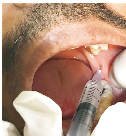
Fig. 2. Needle insertion at the deepest point of the pterygotemporal depression. Benny Joseph et al: Single-insertion technique for anesthetizing the inferior alveolar nerve, lingual nerve, and long buccal nerve for extraction of mandibular first and second molars: a prospective study. J Korean Assoc Oral Maxillofac Surg 2020