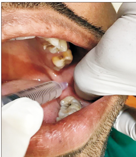
Fig. 3. Retraction of buccal soft tissues and ipsilateral placement of the needle during the initial steps of injection. Benny Joseph et al: Single-insertion technique for anesthetizing the inferior alveolar nerve, lingual nerve, and long buccal nerve for extraction of mandibular first and second molars: a prospective study. J Korean Assoc Oral Maxillofac Surg 2020