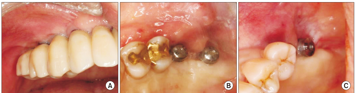
Fig. 1. Lack of keratinized gingiva and vestibular depth due to bone graft and implant surgery. A. Patient #1. B. Patient #2. C. Patient #4. Jeong-Kui Ku et al: Retrospective case series analysis of vestibuloplasty with free gingival graft and titanium mesh around dental implant. J Korean Assoc Oral Maxillofac Surg 2020

Statistical analysis was performed using PASW Statistics for Windows (ver. 18.0; IBM, Armonk, NY, USA). Postoperative changes in the KG and VD were analyzed from the amount of relapse using a Wilcoxon signed rank test. Cor-