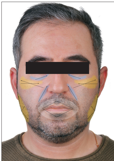
Fig. 1. An illustrative figure of injection technique showing the directions and areas.

Before harvest, the region was injected by a tumescent solution (0.5% lidocaine+0.0005% epinephrine). After 15 minutes, the fat was harvested by a syringe with low negative pressure (0.75-1.0 atmosphere) and blunt tip cannula (2.1-2.4 mm) through a stab incision on the abdomen or thigh. After processing, harvested fats were injected using 1cc insulin syringes and blunt cannulas (0.7-1.2 mm tip) using a tunneling technique in different planes from deep to surface in fan shape order in the malar and periorbital area, nasolabial fold, mandibular angle and body, and perioral area.(Fig. 1) For malar augmentation, the fat was injected subcutaneously through an incision lateral to the nasolabial fold, as well as via a second incision on the zygomatic arch. The fat was placed near the zygomatic bone, as well as beneath, into, and superficial to the zygomaticus muscles and subcutaneous