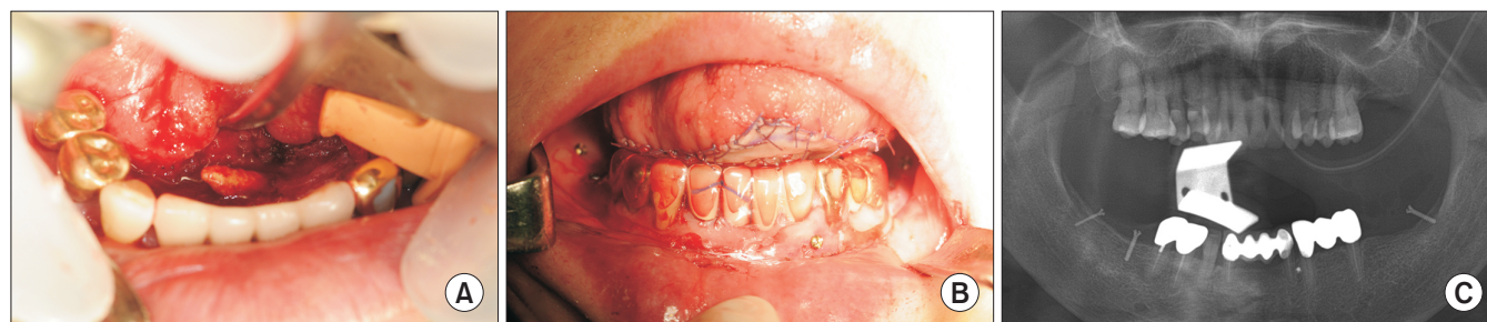
Fig. 2. A. Intra-operative view of the surgical site where the sialolith was identified and removed from the obstructed Wharton's duct. B. A barrier was made from anterolateral thigh split-thickness skin graft and sutured in place with a bolster dressing. Then a plate splint was fixed using microscrews. C. Postoperative panoramic view of the patient following the surgery.

Buyanbileg Sodnom-Ish et al: Acquired synechia of the tongue to the mouth floor. J Korean Assoc Oral Maxillofac Surg 2021