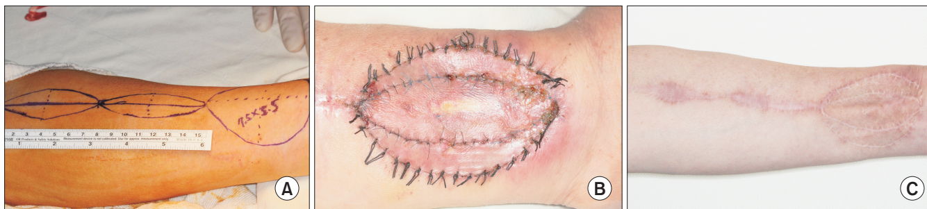
Fig. 2. Design and postoperative appearance of the radial forearm free flap (RFFF) donor-site restoration. A. Preoperative design of the RFFF and full-thickness skin islands for closure of the defect. B. Postoperative two weeks after removal of the tie-over bolus dressing. C. Postoperative healing after 13 months.

Yoon-Sic Han et al: Closure of radial forearm free flap donor-site defect with proportional local full-thickness skin graft: case series study of a new design. J Korean Assoc Oral Maxillofac Surg 2021