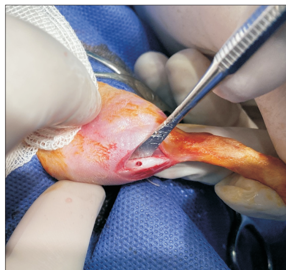
Fig. 1. Tibial osteotomy.

The induced tibial bone fracture did not require fixation and was not extensive enough to create movement limitations. The fractured tibial bone was resected and underwent histological analysis by a pathologist blinded to the group allocation of specimens. The specimens were immediately