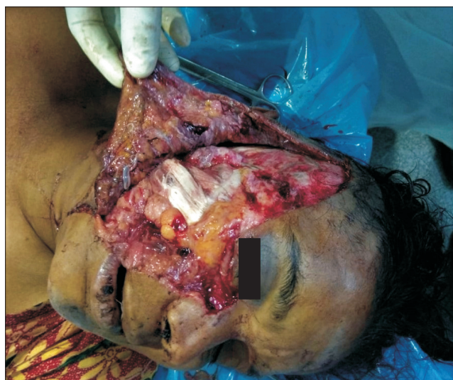
Fig. 1. Degloved facial flap involving the right cheek, oral commissure, lower eyelid, and temporal scalp. Dibya Falgoon Sarkar et al: Complex facial degloving injury: a case report of a complication and its management. J Korean Assoc Oral Maxillofac Surg 2022

their respective original positions. The avulsed external auditory canal was sutured to its proximal part using continuous suturing. The lower eyelid was repositioned and sutured in layers. Postoperative dressing was applied to prevent hematoma. The patient was transferred to the general ward for observation and was kept on antibiotic therapy to prevent wound infection. Since the patient had experienced a fractured mandible, she was kept on a soft diet. The patient was planned for open reduction and internal fixation of the mandibular fracture under general anesthesia.