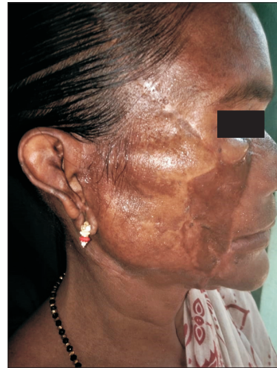
Fig. 6. Postoperative photograph after one year.

Degloving soft tissue injuries can be classified as either open or closed lesions 4 . Open degloving injury generally manifests as soft tissue avulsion, whereas closed degloving injury presents as a cavity filled with hematoma and liquefied fat 7 . Open degloving lacerations are more common in