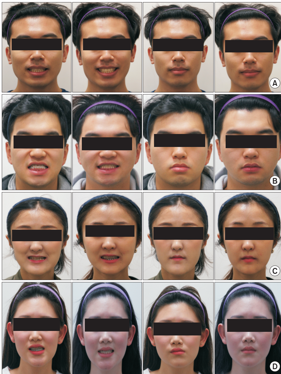
Fig. 1. Example facial photographs of each group: (A) Group 1 patient, (B) Group 2 patient, (C) Group 3 patient, and (D) Group 4 patient. (Group 1: the control group, Group 2: the group that had one-jaw surgery, Group 3: the group that had two-jaw surgery for mandibular protrusion, Group 4: the group that had two-jaw surgery for facial asymmetry)

This study was approved by the Institutional Review Board of Dankook University Dental Hospital (IRB No. DKUDH