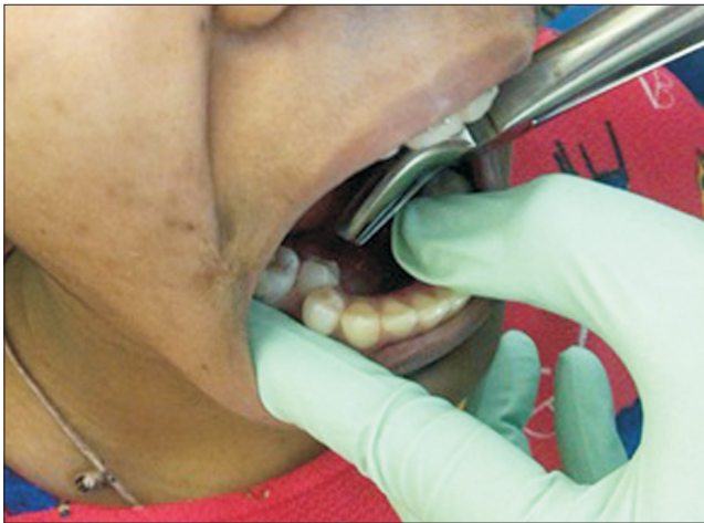
Fig. 2. Lingual approach using maxillary forcep. Omkar Anand Shetye et al: Intra-alveolar extraction of linguoverte mandibular premolars – the Shetye technique: a technical note. J Korean Assoc Oral Maxillofac Surg 2022

purposes. Since the teeth were healthy with no caries, upper premolar forceps were used to extract the lower premolars. Following local anaesthesia, only the lingual periodontal ligament (PDL) fibres were severed to gain access to the teeth. The chair was positioned two inches lower than the ideal position for extracting lower teeth. The approach to the teeth was lingual and from the opposite direction (for example, approaching from the right side for a left mandibular premolar). (Fig. 2)