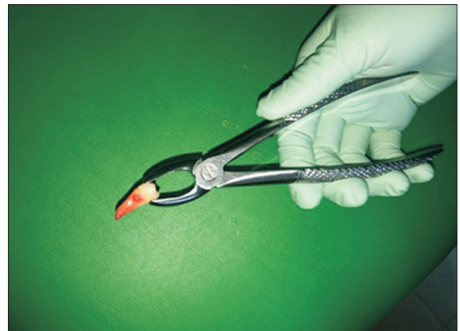
Fig. 4. Extracted intact tooth. Omkar Anand Shetye et al: Intra-alveolar extraction of linguoverte mandibular premolars – the Shetye technique: a technical note. J Korean Assoc Oral Maxillofac Surg 2022