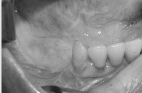
Fig 1. Edentulous mandible with advanced resorption of the alveolar process.