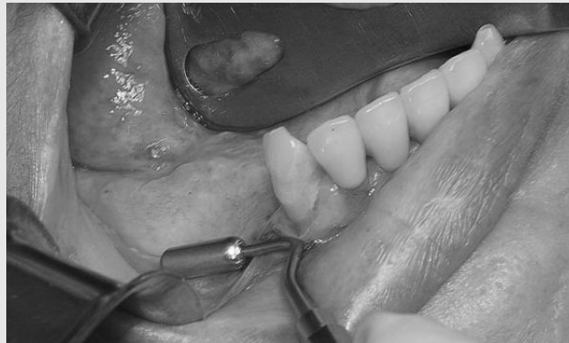
Fig 3. Measurement of the expander size using the surgical template.

titanium screw(Micro Auto Screw, Jeil Medical Corporation, Seoul, Korea)(Figs. 4, 5). Primary flap closure was performed without tension. The patients were administered antibiotics and analgesics three times a day for 7 days, with a 0.12% chlorhexidine mouth rinse.