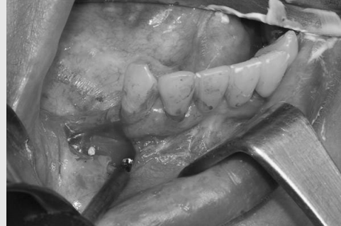
Fig 5. The expander was fixed with titanium screw.