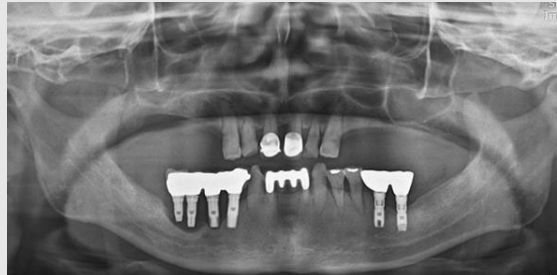
Fig 2. Radiographic evaluation of failing implants placed at the site of right posterior mandible.