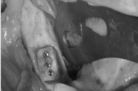
Fig 9. The atrophic ridge was reconstructed by chin bone graft.