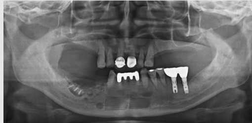
Fig 10. Radiographic evaluation after ridge augmentation by block bone graft and GBR simultaneously with removal of expander.

closure was accomplished with horizontal mattress sutures and interrupted sutures. Distraction osteogenesis was performed in one patient. Antibiotics and analgesics were prescribed as above, with a 0.12% chlorhexidine mouth wash. The sutures were removed 2 weeks after surgery, and the patients returned for follow-up visits every 2 weeks thereafter. Approximately 6 months later, re-entry surgery was performed to insert the implant(Fig. 11); the osseointegration was investigated clinically and radiographically(Fig. 12).