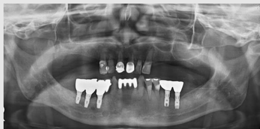
Fig 12. Radiographic evaluation after 2 years implant loading. The implant do not show any crestal bone loss.