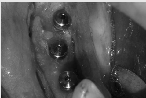
Fig 11. Three implants were placed 6 months after ridge augmentation.

Six patients(3 men and 3 women, aged 47-63 years) underwent self-inflating osmotic tissue expander treatment in advance of vertical ridge augmentation. All patients were partially edentulous with severely atrophic deficiencies, which were classified as Seibert Class III( i.e. , vertical and horizontal defects) 12) . Four defects were located in the posterior mandible and the alveolar ridge was resorbed to the level of the basal bone of the mandible. Two defects were located in the anterior and posterior maxillary