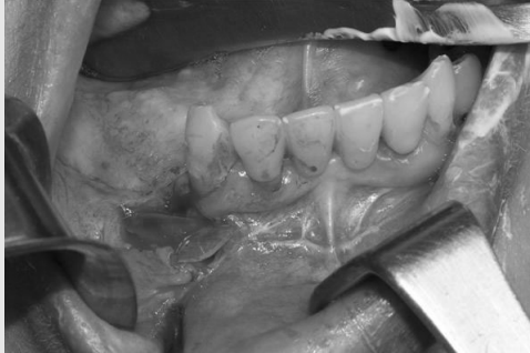
Fig 4. The subperiosteal pouch was prepared and the expander was inserted. The fibrous scar caused by previous surgical treatment was observed.