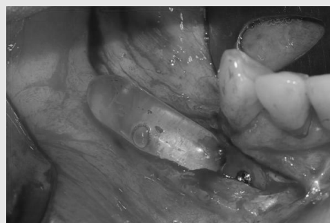
Fig 7. The tissue expander was fully expanded and removed.