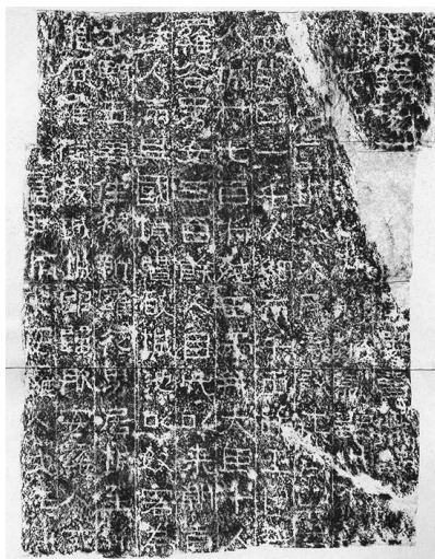
Figure 4. Rubbed copy of the Gwanggaeto Stele's inscription from the collection of Mizutani Teijirō (Middle of the second page)

For the inscription's purpose, the "Gwanggaeto Stele