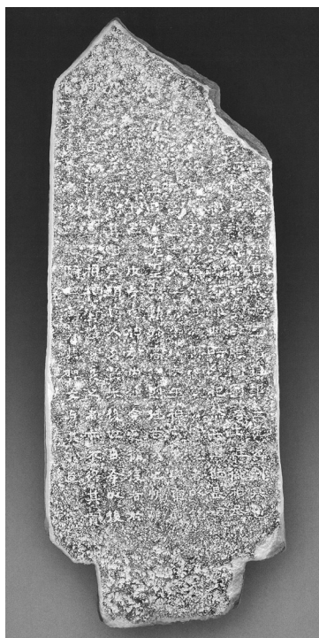
Figure 2. Ji’an Koguryo Stele

King Jangsu (長壽王), who succeeded his father King Gwanggaeto, erected a stele two years after his father’s death in 414 to commemorate his father’s accomplishments. That stele is now known as the Gwanggaeto Stele. It stands 6.39 meters tall with irregular widths from between 1.3 meters to 2 meters on each side and weighs approximately 40 tons. Made of tuff, a kind of volcanic rock, the stele’s overall shape of a huge stone pillar resembles that of a natural rock. Such tombstones erected by