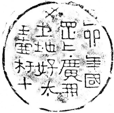
Figure 5. Rubbed copy of the inscription 'Gwanggaeto taewang' on a bronze bowl from Houchong Tomb

script” could be classified as a stone inscription script. In this sense, Koguryo had been developing its own unique stone inscription scripts such as the Gwanggaeto Stele script while the clerical official script (八分) was generally being used for stone inscriptions in central China during the Wei and Jin periods. The new clerical script (新隸體) chiefly found in roof tile inscriptions from the first half of the fourth century seems to have had a certain influence over the creation of Koguryo-style inscription scripts. The calligraphic style of inscriptions found in the Chunchuchong and Taewangreung stelae displays an adaptation of an old style of character shapes and configurations with straight-lined strokes, an overall appearance which closely resembles that of the Gwanggaeto Stele. Calligraphic styles of this type had already been invented by the Koguryo royal court to represent the authority and majesty of the royal tombs, even before inscriptions were carved on the Gwanggaeto Stele. The Gwanggaeto Stele script thereby emerged as an independent calligraphic style amid the inscription script’s development in Koguryo, and under the special circumstance of constructing a tombstone for the Great King Gwanggaeto (國置上廣開土境 平安好大王).