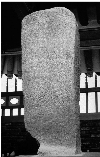
Figure 3. Chungju Koguryo Stele

King Gwanggaeto and King Jangsu violated the policy strictly prohibiting the erection of tombstones in central China, which demonstrates that Koguryo had independently made policy decisions at the time. This stone pillar style can also be found in the Chungju Koguryo Stele (忠州高句麗碑) discovered in what once was the southernmost part of Koguryo territory, which had been incorporated through King Jangsu's southward expansion policy. This 126-144 centimeter tall and 31-55 centimeter wide stele looks like a square pillar