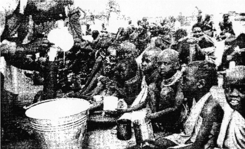
심각한 식량위기로 하여 기아에 시달리는 아프리카인들

on an almost daily basis, articles describing a horrendous hunger crisis unfolding across all developing countries. For instance, “At least 300 million people in Africa are facing a food crisis [...] 800 million people do not have enough food” 29 and “every day, 8000 children die of hunger and malnutrition.” 30