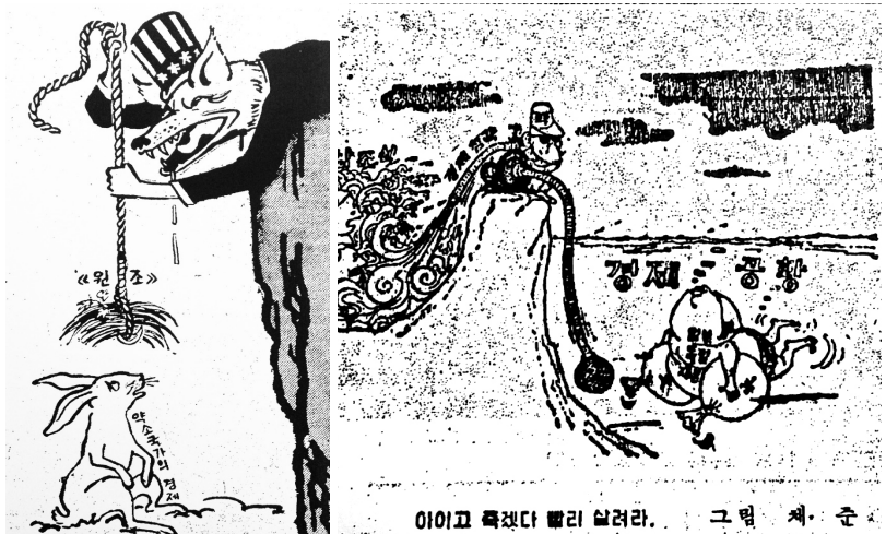
Figs. 3 and 4. Published decades before the arrival of Western aid, these two satirical cartoons

demonstrate the consistency of anti-aid themes within state media up to the present day: how aid is used as a bait to damage and subjugate the economies of small and weak countries (fig. 3, 1962) and how Americans suck dry a country of its resources (fig. 4, 1965).