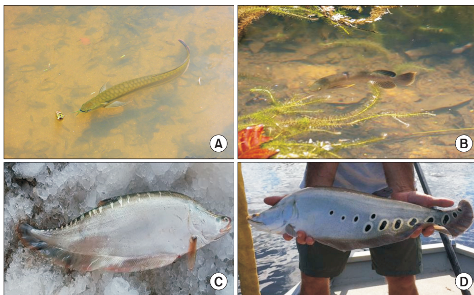
Fig. 3. Major imported species of ornamental Osteoglossiformes. Photos licensed under CC BY-NC 4.0 via GBIF: (A) Osteoglossum bicirrhosum (Tong, 2021); (B) Scleropages formosus (Han, 2022); (C) Chitala chitala (Leela123_nunna, 2022); (D) Chitala ornata (Wingedg2, 2017).

Chitala ornata (15,512; 8.8%), S. formosus (13,869; 7.9%), Gnathonemus petersii (10,344; 5.9%), and Mormyrus longirostris (10,256; 5.8%). These six species together accounted for 79.4% of the total imported individuals (Fig. 3, Appendix 1) (Han, 2022; Leela123_nunna, 2022; Tong, 2021; Wingedg2, 2017). Two of the imported species (4.7%) were identified as internationally threatened under CITES (Appendix 1). S. formosus has been continuously imported since 2009 despite being listed in CITES Appendix I, which includes species threatened with extinction for which international commercial trade is generally prohibited. A. gigas has also been continuously imported since 2010 and is listed in Appendix II, which covers species not necessarily currently threatened with extinction but whose trade must be regulated to prevent unsustainable exploitation. Under the CITES permitting system, Appendix I specimens may be traded only under exceptional, non-commercial circumstances and require both export and import permits, whereas Appendix II specimens re-