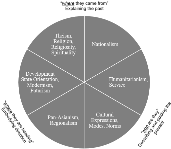
<Fig 1> Proposed Dimensions of Manifested and Constructed ASEAN Identity through Shared Cultural Heritage in Southeast Asia

development. For instance, the ASEAN member countries should actively explain and demonstrate to the average people what ASEAN represents. Fostering strong collaboration and mutual support at the local, national, and personal levels are likely to result in the development of a developing sense of identity.