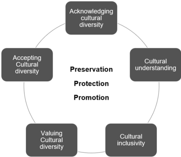
<Fig 3> Proposed Dimensions of Socio-Cultural Solidarity

cultural understanding. Disparities in race and ethnicity lead to miscommunication, missed opportunities, and occasionally violent incidents. Communities lose money and human resources because of racial and ethnic disputes, which also prevent different cultural groups from working together to resolve their main problems. 3) The inclusion of individuals from diverse cultural backgrounds in decision-making processes is necessary for the success of policies or initiatives. Participation of those impacted by decisions in the formulation of remedies is a fundamental democratic value. There is a considerably lower chance of decision-making, execution, and follow-through in the absence of feedback and support from all the relevant parties. 4) In order to have a just and equal society, one must value cultural diversity. For instance, individuals feel more welcomed and accepted to a wider community if others are aware and conscious of, and value their respective culture. 5) Learning and accepting about the influences that cultural communities have had on history and culture provides an accurate view and understanding of the region's overall image.