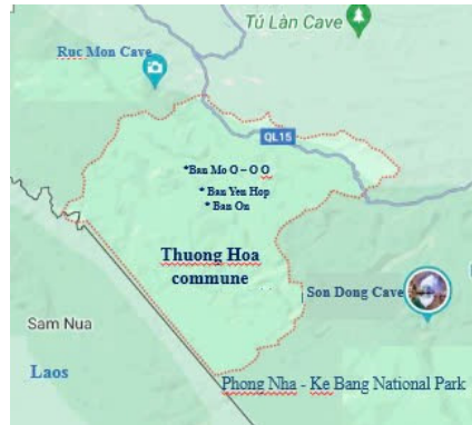
<Figure 2> Map of Thuong Hoa Commune, Minh Hoa District, Quang Binh Province, Vietnam. Source(s): By author based on Google Maps

The Ruc people are a local subgroup of the Chut ethnic group, primarily residing in the mountainous areas of western Minh Hoa district, Quang Binh province, near the Vietnam-Laos border. The Ruc are believed to have migrated from northern Vietnam several centuries ago. Their name "Ruc" originates from the name of a stream in their residential area. In 1959, the Ca Xeng Border Guard discovered a group of people living in caves in the mountains near the Laos border. These individuals lived a nomadic life, relying on hunting and gathering, and used tree bark